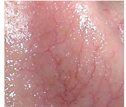
Telangiectasia or Couperose

HOW IS THE NON-INVASIVE PROCEDURE DONE? The surface of the skin is cleansed and prepped. A fine tipped sterile probe is placed on the surface of the skin. Low-level RF and DC current are passed through the probe to the vessel. The tiny vessel is clotted or coagulated and blood stops flowing. With proper post-treatment care the vessel is naturally absorbed into the surrounding tissue. Typically within three to four weeks the vessel disappears.