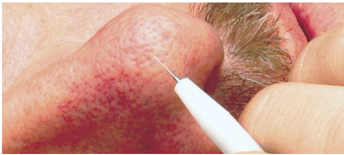
Easy to learn procedure removes telangiectasia, cherry angiomas, spider veins and skin tags.

THE VASCUTOUCH PROVIDES AN INEXPENSIVE means to quickly and easily remove vascular lesions such as Telangiectasia (distended capillaries), cherry angiomas, spider veins, and skin tags found on the face and body. The VascuTouch yields superior results when compared to other electronic devices that commonly cause scarring and hypo and hyperpigmentation. When compared to laser treatment, the VascuTouch produces similar results without the pain, bruising, or high treatment costs. The VascuTouch is an indispensable tool for treating cosmetic vascular problems.